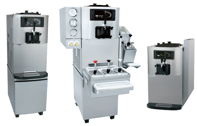
Optional cart with front opening door